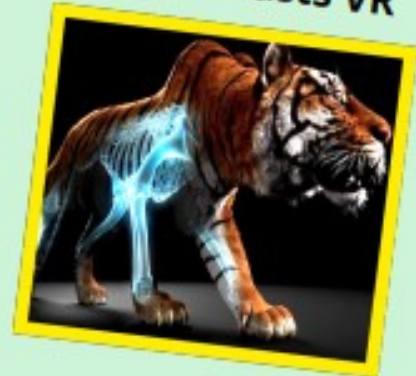
Wild Beasts VR